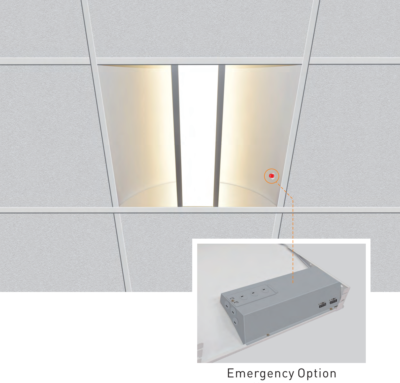
Emergency Option Up to 120 minutes in event of power failure.