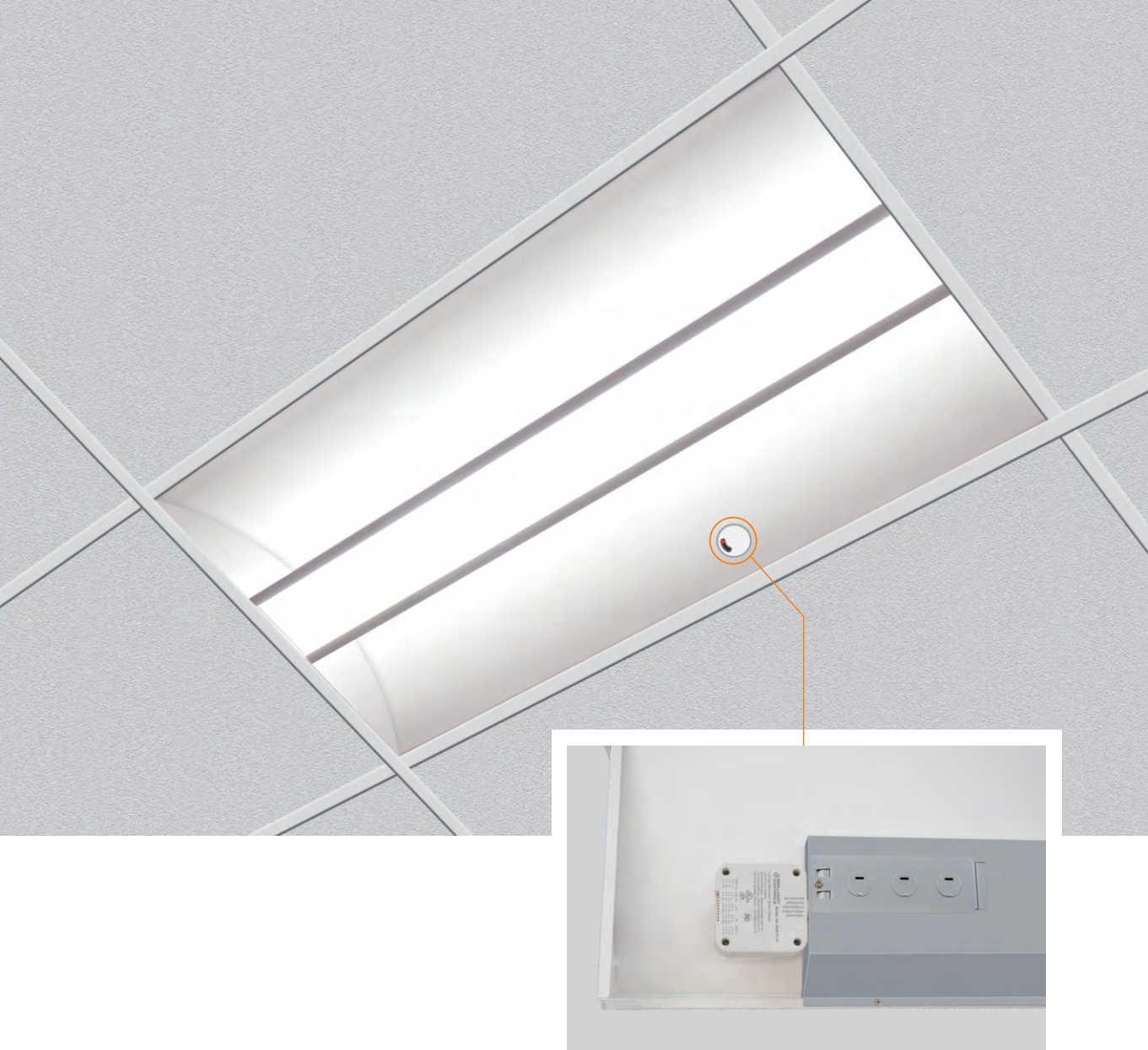
Microwave Sensor Option Line Voltage Daylight Harvest / Bi-Level